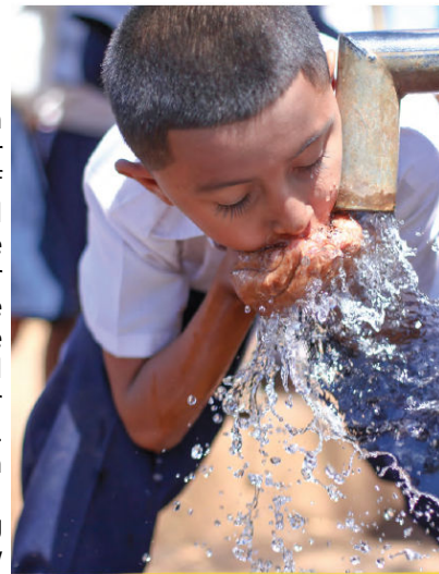
St. Timothy Lutheran Church

Living Water's deeper goal—the reservoir of hope that fed into their other efforts—was that the community members would understand the living water of the gospel through their safe water access. The staff, local church, and Living Water Trips team members dedicated time to an evangelism session in order to study God's Word in fellowship together. The way that you selflessly gave your resources, time, and efforts in order to improve their way of life was a testament to the love of God, St. Timothy Lutheran Church. The living water, and the water that you gave to the community would continue to flow into many aspects of their lives. Thank you for giving them water, for life, in Jesus' name.