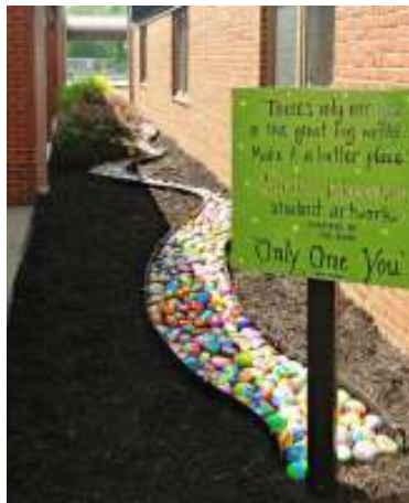
samples of how we may use our painted rocks