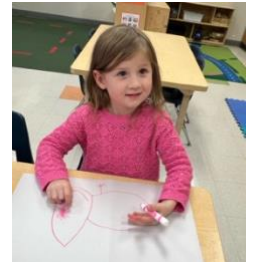
Drawing Strangely Colored Animals (Brown Bear, Brown Bear by Eric Carle)

The lesson plans that you receive each week show you a great picture of what children are learning and experiencing each week. But what happens after 3:00? All classes (except I11) use a curriculum called Story Stretchers. Each day the classes are given a book to read together. Then they engage in activities that “stretch” their understanding of the book and help connect what they have read to the world around them.