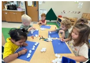
Cloud pictures with cotton balls (Flying by Donald Crews)