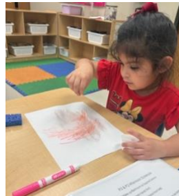
Sprinkling salt on damp art to look like snow (The First Snowfall by Anne Rockwell)

For more information, please visit our website at www.stlhouston.org